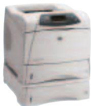
hp LaserJet 4200tn and hp LaserJet 4300tn