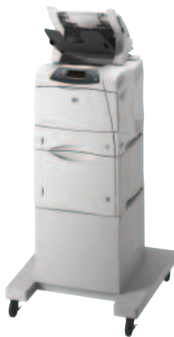
hp LaserJet 4200/4300 printer with additional accessories