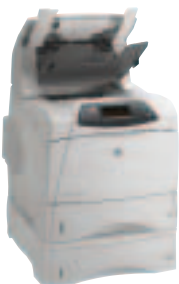
hp LaserJet 4200dtnsl and hp LaserJet 4300dtnsl

For business users in enterprise, large, medium and small organisations the HP LaserJet 4200 and HP LaserJet 4300 series offer reliable HP LaserJet performance, unrivalled versatility and an easy to use and manage solution which meets the high printing demands of workgroups of 5-15 users.