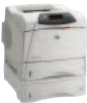
hp LaserJet 4200dtn and hp LaserJet 4300dtn